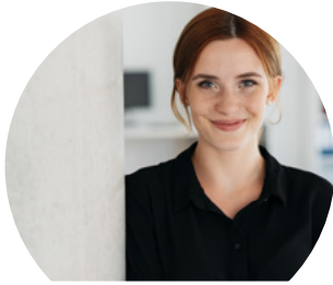
Corporate EHS teams

Multiple stakeholders need updates on emerging EHS regulations — but they each have different requirements. In this infographic, we explore what each of them needs.